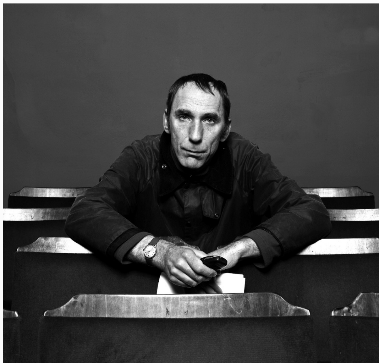
Will Self